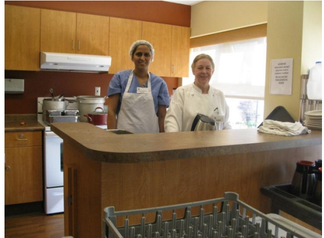
Figure 1: Cooking in the New Country Kitchens

We have opened the country kitchens on 6East, 5East and 4East. Regular meal service is now being provided on each resident floor in the new dining rooms.