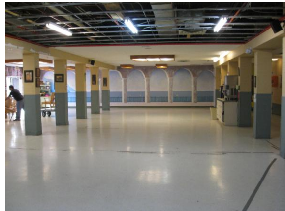
Figure 3: Farewell to the Main Dining Room